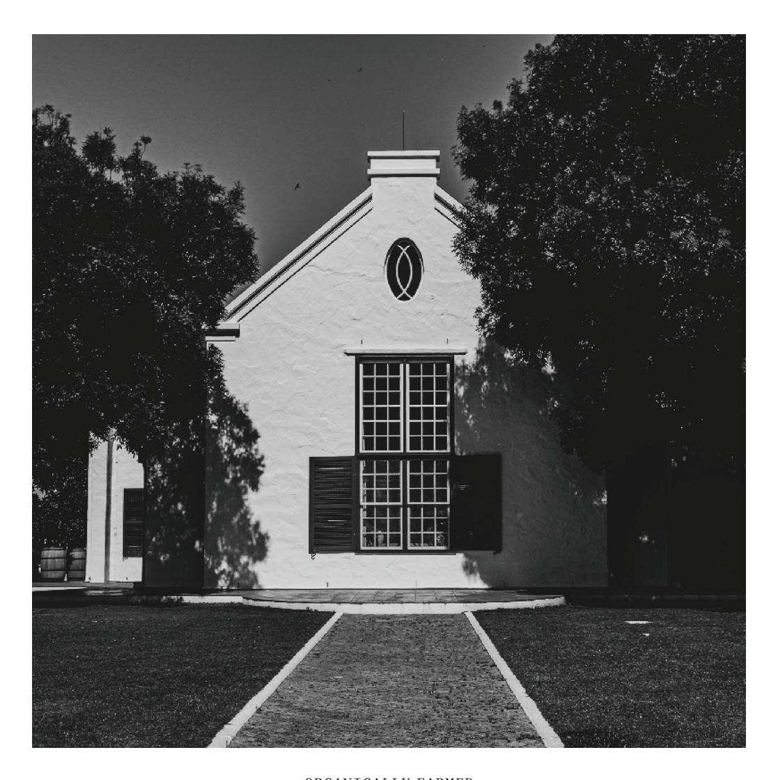
ORGANICALLY FARMED 100% ESTATE GROWN AND MADE WINES OF PLACE