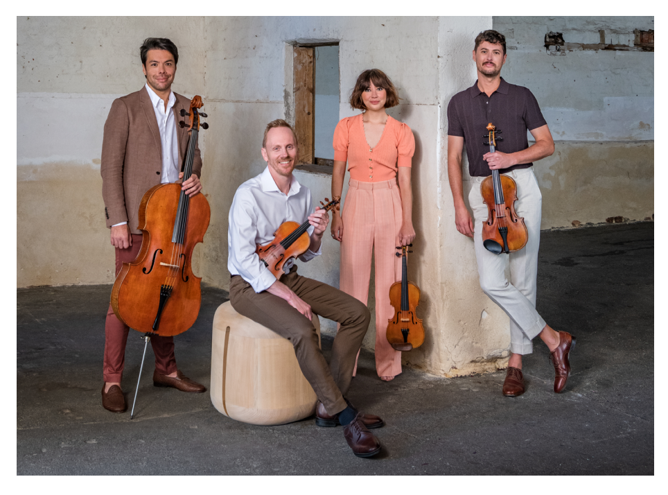
The Australian String Quartet.

The Australian String Quartet (ASQ) has revealed an expansive 2024 program featuring national and international performances, world-class festival appearances and enthralling new collaborations. The ASQ's program showcases a quartet united by the vision to inspire people to live a more musical life.